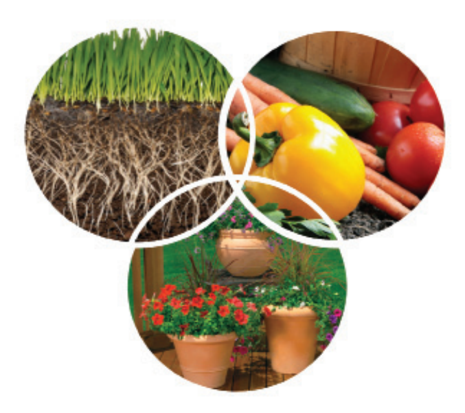
"Healthy Soil...Healthy Plants!" "Healthy Soil...Healthy Lawns!"